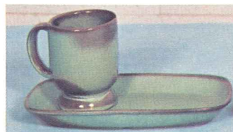
COFFEE AND DESSERT SET 3.75 5PS—9" PLATTER-TRAY C2—10 OZ. MUG 3.25 (or choose your own style Mug — See Pg. 9)