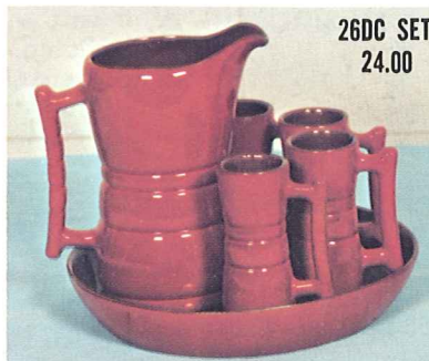
26DC SET 24.00