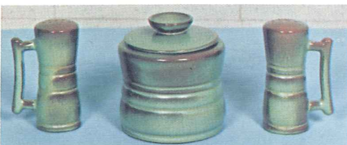
26G—SUGAR/GREASE 9.25 26H—SALT & PEPPER 6.00 26GH—4-PIECE SET/BOXED 15.00