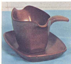
6S—TWO-SPOUT GRAVY 6.50 5PS—9" PLATTER-TRAY 3.75 6S/ST—TWO-SPOUT GRAVY/W TRAY 10.00