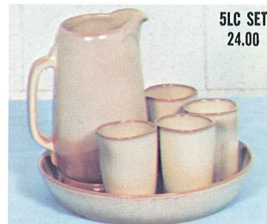
5LC SET 24.00