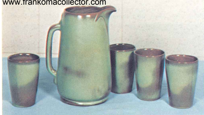
9.25 80—2 QT. PITCHER 5L—12 OZ. TUMBLER 3.75