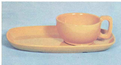
SOUP AND SANDWICH SET 4SC—11 OZ. SOUP CUP 3.75 6P—11" PLATTER-TRAY 4.50