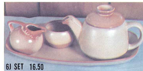
6J SET 16.50