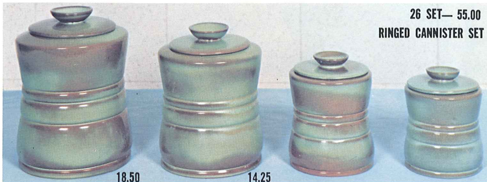
26 SET— 55.00 RINGED CANNISTER SET