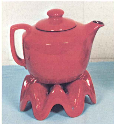
5TL/W—TEAPOT & WARMER SET 20.00 5TL—12-CUP TEAPOT WA1—WARMER 13.00 7.50