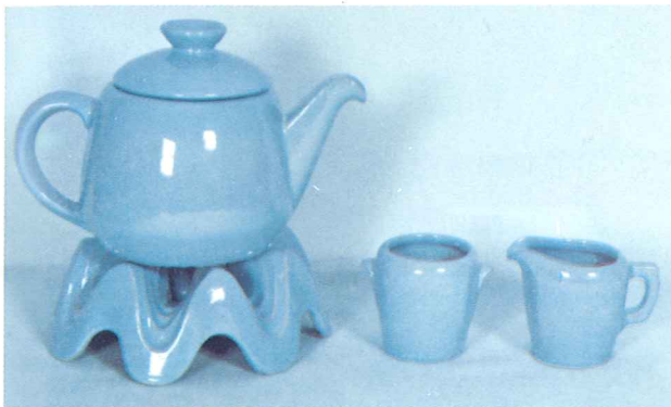
6T—6 CUP TEAPOT 9.25 5DA—6 OZ. CREAMER 3.25 WA3—6" WARMER W/CANDLE 5.00 5DB—6 OZ. SUGAR 3.25