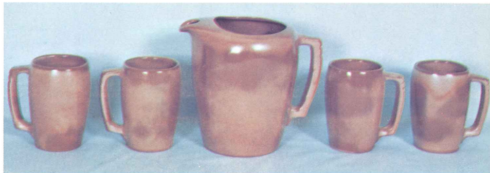
12.50 5D—3 QT. PITCHER 5M—16 OZ. MUG 4.50